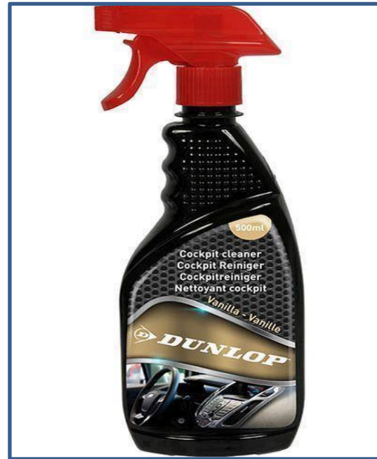
Photo de l'article Picture of the item

L'objet de la déclaration décrit ci-dessus est conforme à la législation d'harmonisation de l'Union applicable: The described object of the declaration is in conformity with the relevant Union harmonisation legislation: