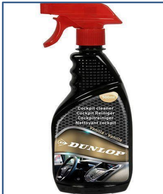
Foto des Artikels Picture of the item

Der Artikel wie beschrieben ist konform mit den einschlägigen Harmonisierungsrechtsvorschriften der Union: The described object of the declaration is in conformity with the relevant Union harmonisation legislation: