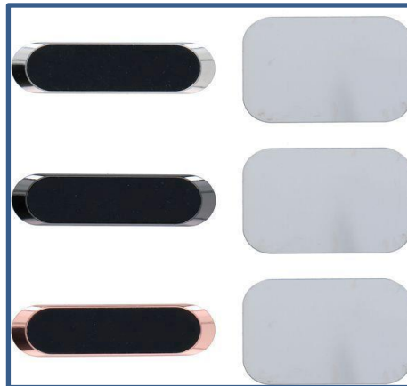
Foto des Artikels Picture of the item

Der Artikel wie beschrieben ist konform mit den einschlägigen Harmonisierungsrechtsvorschriften der Union: