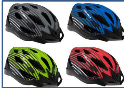
Foto des Artikels Picture of the item

Der Artikel wie beschrieben ist konform mit den einschlägigen Harmonisierungsrechtsvorschriften der Union: