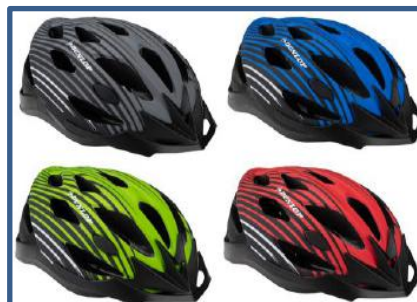
Foto del prodotto Picture of the item

L'oggetto descritto della dichiarazione è conforme alla pertinente normativa di armonizzazione dell'Unione: