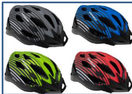
Foto des Artikels Picture of the item

Der Artikel wie beschrieben ist konform mit den einschlägigen Harmonisierungsrechtsvorschriften der Union: