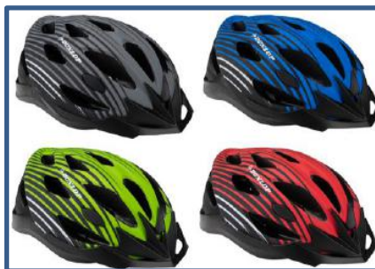
Foto van het artikel Picture of the item

Het beschreven voorwerp is in overeenkomst met de desbetreffende harmonisatiewetgeving van de Unie: