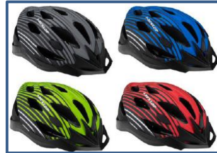
Foto del prodotto Picture of the item

L'oggetto descritto della dichiarazione è conforme alla pertinente normativa di armonizzazione dell'Unione: