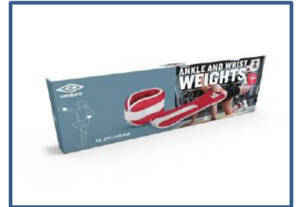
Photo de l'article Picture of the item

L'objet de la déclaration décrit ci-dessus est conforme à la législation d'harmonisation de l'Union applicable: