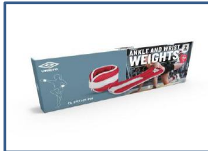
Foto del prodotto Picture of the item

L'oggetto descritto della dichiarazione è conforme alla pertinente normativa di armonizzazione dell'Unione: