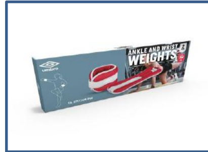
Foto del artículo Picture of the item

El objeto descrito de la declaración se ajusta a la legislación pertinente de armonización de la Unión: The described object of the declaration is in compliance with the relevant Union harmonisation legislation: