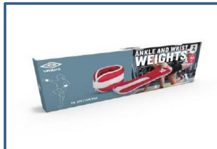
Foto do artigo Picture of the item

O objecto descrito da declaração está em conformidade com a legislação de harmonização da União aplicável: