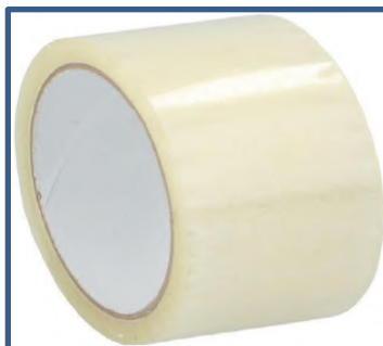
Foto des Artikels Picture of the item

Der Artikel wie beschrieben ist konform mit den einschlägigen Harmonisierungsrechtsvorschriften der Union: