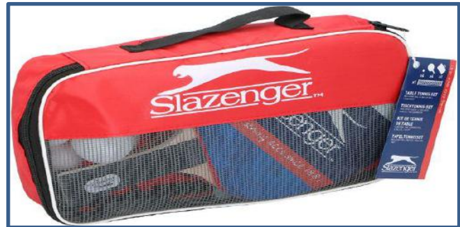
Photo de l'article Picture of the item

L'objet de la déclaration décrit ci-dessus est conforme à la législation d'harmonisation de l'Union applicable: The described object of the declaration is in conformity with the relevant Union harmonisation legislation: