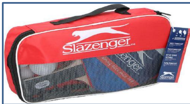
Foto des Artikels Picture of the item

Der Artikel wie beschrieben ist konform mit den einschlägigen Harmonisierungsrechtsvorschriften der Union: