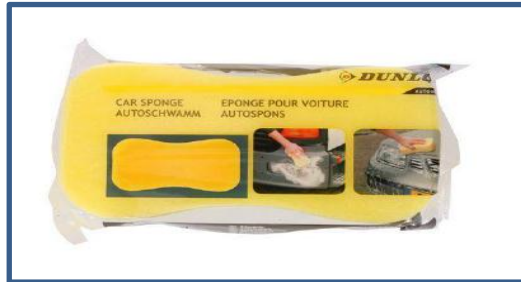
Foto des Artikels Picture of the item

Der Artikel wie beschrieben ist konform mit den einschlägigen Harmonisierungsrechtsvorschriften der Union: