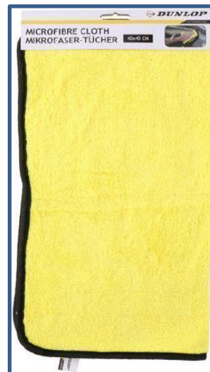
Foto van het artikel Picture of the item

Het beschreven voorwerp is in overeenkomst met de desbetreffende harmonisatiewetgeving van de Unie: