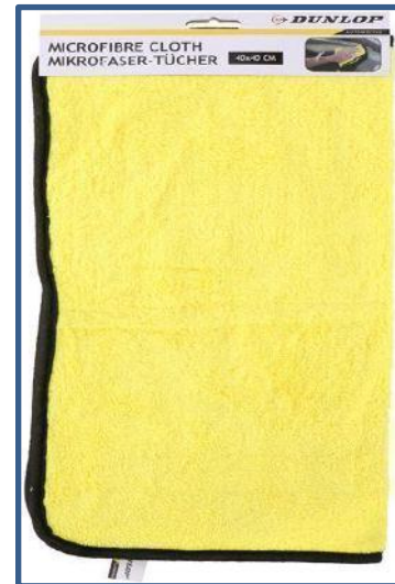
Foto des Artikels Picture of the item

Der Artikel wie beschrieben ist konform mit den einschlägigen Harmonisierungsrechtsvorschriften der Union: