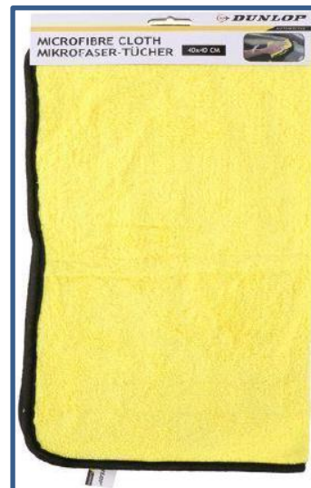
Photo de l'article Picture of the item

L'objet de la déclaration décrit ci-dessus est conforme à la législation d'harmonisation de l'Union applicable: